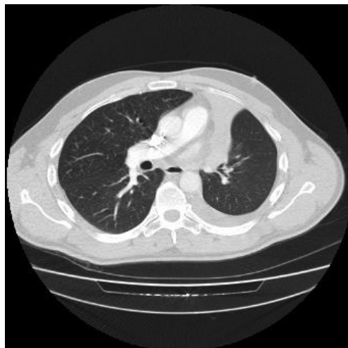
Figure 2 Computed tomography scan.